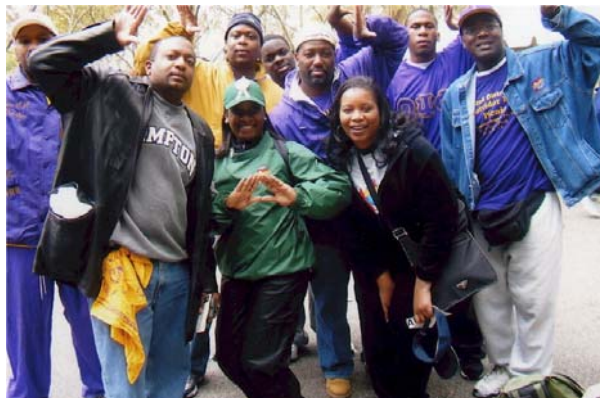
Xi Phi Brothers and Sorors at the 2004 Walk for Diabetes

We, the members of the Walk Team, would like to thank the members of Xi Phi Chapter and our loved ones who contributed to our fundraising efforts for a very important health cause that is disproportionately affecting the African American community.