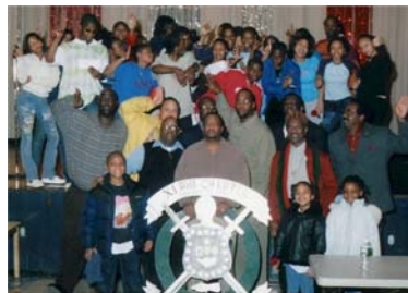
Left: Participants of the Talent Hunt competition joined with the brothers of Xi Phi chapter and visiting brothers of Omega Psi Phi Fraternity.

Plans for next year's competition are already underway and promises to be much more thrilling and entertaining than this year's talent hunt program, if that is humanly possible. Xi Phi