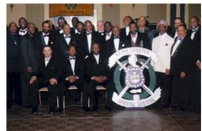
The Brothers of Xi Phi Chapter

On Saturday, March 19, 2005, Xi Phi Chapter hosted its Eighteenth Annual Benefit Dinner Dance at the Crowne Plaza LaGuardia Hotel in East Elmhurst, NY. Thanks to the patronage of numerous brothers from Xi Phi and other metropolitan chapters plus the support of many family members, friends and other Greek and civic organizations, the dinner dance was an overwhelming success.