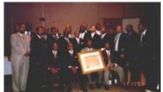
Xi Phi Brothers are well represented at the Metro Chapters Founders Day Program, November 17, 2001 at Kingsborough Community College in Brooklyn, NY.