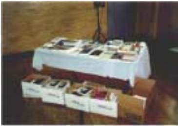
Books donated to children center library