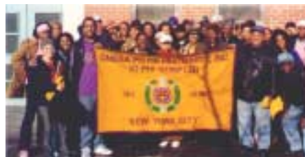
BCT Staff, Students and Parents

The last Tour workshop found a lot of tired but satisfied chaperones and students. We reminisced about some of the highlights of the tour, and things that could have been done better. I had the pleasure of giving my team of ladies a dozen Roses apiece to let them know how much I thought of them, and how well they performed on the Tour. I do believe that all of the ladies will go on to do wonderful things in life, and I'm nothing less than happy about the opportunity that I got to watch them during this stage of their school career.